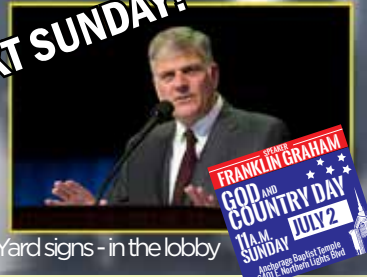
Yard signs - in the lobby